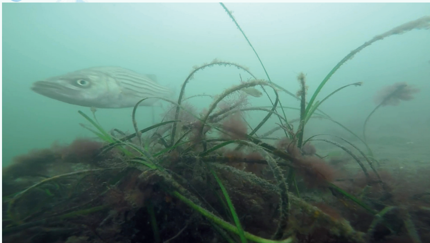
E e l g r a s s