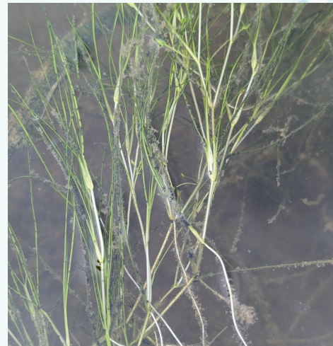
W i d g e o n G r a s s

Help the New York Botanical Garden and the NY-NJ Harbor & Estuary Program collect observation data. We are looking for submerged marine plant species to research and protect! Just create an account in the iNaturalist app and take photos when you find these and other aquatic plants. We're collecting observations all month long!