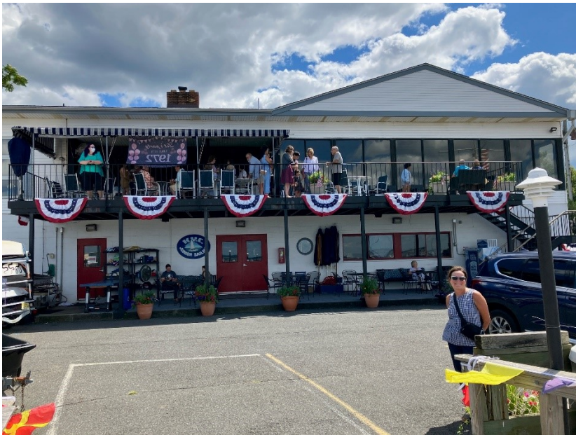
Keyport Yacht Club

The first week of August found the Cruising Fleet of Minisceongo YC in Raritan Bay and Sandy Hook. We were welcomed at both Keyport YC and Great Kills YC, each for a 2-day stay. They both shared the best part of boating: warm welcome, meeting new people, sharing boating stories and the camaraderie of HRBYCA boaters. Thanks to both clubs from Minisceongo YC!