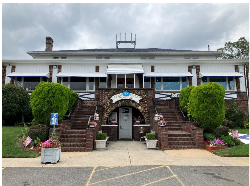
Great Kills Yacht Club