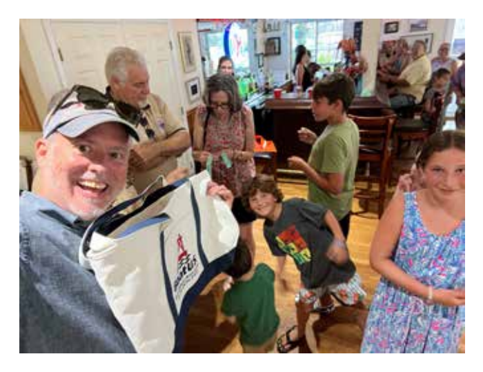
More pictures on the website